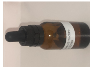
Cannabinoids (% weight)